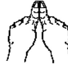
ILLUSTRATION OF SUCCESS OR FAILURE OF A MARRIAGE

When a couple establish the same goals in life, such as to serve and honor the Lord Jesus Christ, and each is happiest when pleasing the other one and seeing the sparkle of happiness in his or her eye, that couple will grow ever closer together through the years.